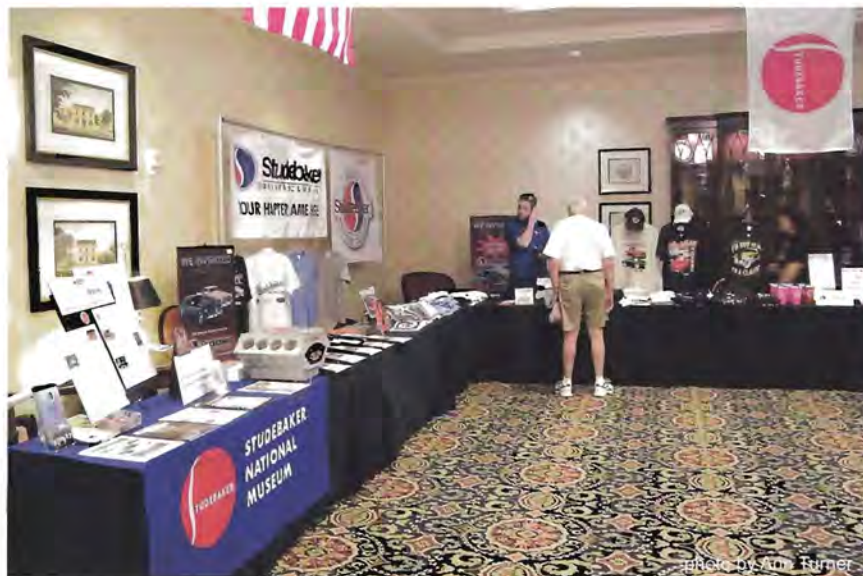
The Studebaker National Museum swap meet booth.

The meet began in earnest on Monday, June 30th with the National Board Meeting which wrapped-up in early afternoon. Coverage of that meeting can be found elsewhere in this issue. An excellent seminar on the Studebaker Weasel was presented by TNJ Murray Company and was well attended with a roundtable of questions. This third generation company, located less than a mile from Dover Downs Hotel, prepared Studebaker's Weasels for the war effort during