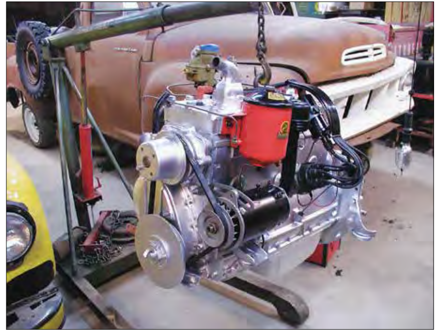
A recently rebuilt 245 for the 4WD in the background.

Next, it is good to pull the soft or expansion plugs from the block. Recently, I worked on a block for a Champion engine. When the soft plugs were removed, the answer to the customer's question of overheating was answered. There was so much rust and residue in this block that there was no room left for water. Even the passages in the head were full of thick mud. Now if you thought the oil mixed "goo" was hard to remove, the mud in the water jacket is worse. With no room in and around the cylinder walls to put a scraper, a wire must be used that will fit, to stir and