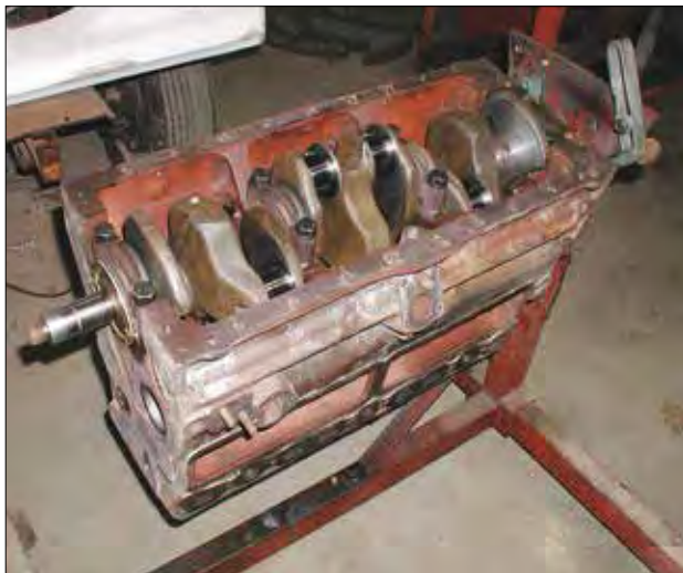
A Commander 8 crankshaft installed ready for rebuild.

wash the area clean. Soap does not work. Only moving water and something to stir the thick mixture with will remove it. A high pressure washer works very well. When all is clean, nice new soft plugs need to be installed with a good sealer to prevent leaks.