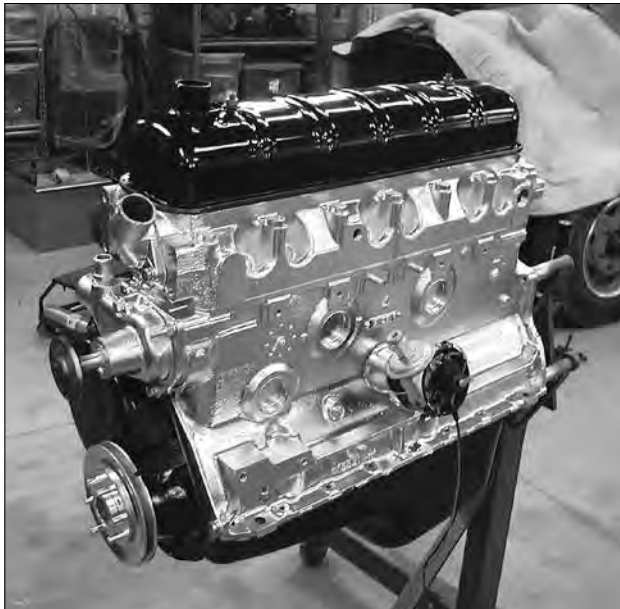
A recently rebuilt Studebaker OHV converted with 185 crank and pistons.

Another by-product of non-detergent oil, or at the very least few oil changes during engine life, is a worn crankshaft. Studebaker used steel when making crankshafts,